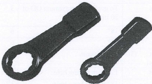
Figure 1: Hammer/sluggish wrenches

Item 3 – Hammer wrenches: We require ring wrenches as shown in fig. below.